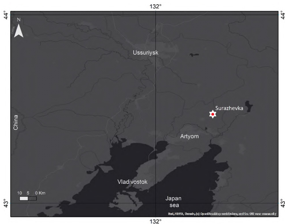
Fig. 1. Study area.

The influence of biochar on soil properties and yield was studied in the framework of a stationary field experiment established in 2018 – 2019 on the territory of Primorskaya vegetable experimental station VNIIO LLC (Surazhevka village, Primorsky region, Russia) (Fig.1). On the territory of the station were selected two fields that were comparable in terms of terrain and soil conditions, one of which had a drainage system, the other did not. On each of the fields, three plots of 21.6 m 2 (1.8 X 12 m) were allocated, with a total of 6 plots. The control plots of each field had no biochar (control-BC0), in other plots was added 1 kg/m 2 of biochar (BC1) or 3 kg/m 2 of biochar (BC3) to other plots on a one-time basis (Fig.2).