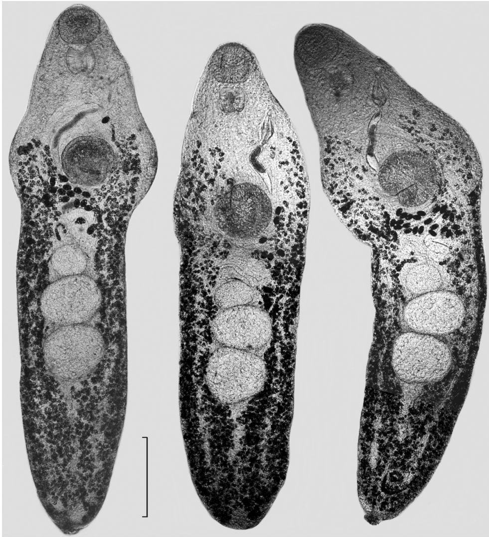
Fig. 1. Photograph of live gravid specimens of Dimerosaccus oncorhynchi from Salvelinus curilus of Klyuch Glubokyi River, flattened under slight pressure, in ventral view.