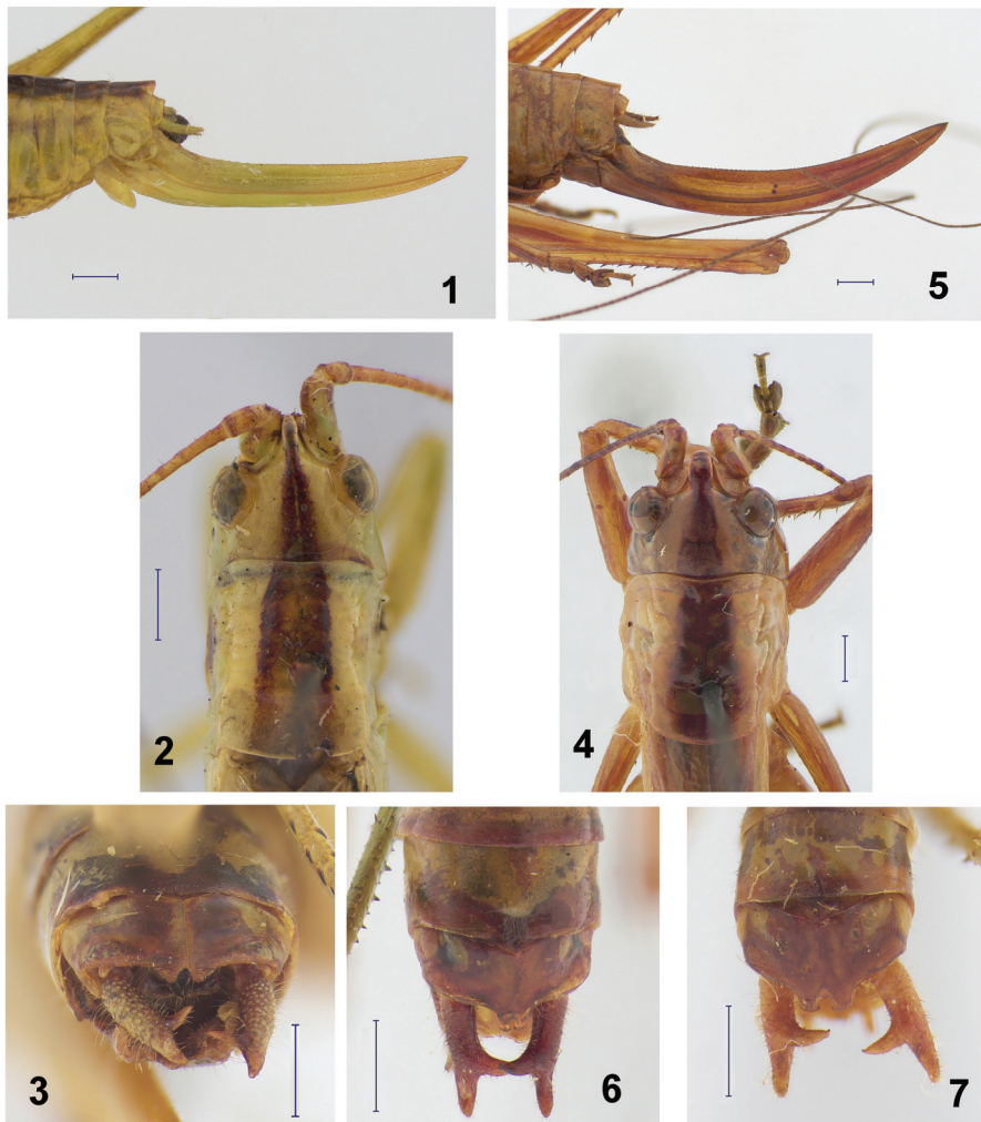
Figs 1–7. Conocephalus spp. 1, 2 – C. chinensis : 1 – ovipositor, lateral view, 2 – head, dorsal view; 3 – C. fuscus , apex of male abdomen, dorsal view; 4–6 – C. dorsalis : 4 – head, dorsal view, 5 – ovipositor, lateral view, 6 – apex of male abdomen, dorsal view; 7 – C. beybienkoi , apex of male abdomen, dorsal view. Scale bars = 1 mm.

DISTRIBUTION. Mongolia (Fig. 00), Europe (except the North), Turkey, Caucasus, Kazakhstan, Russia (European part, the southern parts of W Siberia including Altai, Krasnoyarsk Region and Khakassia).