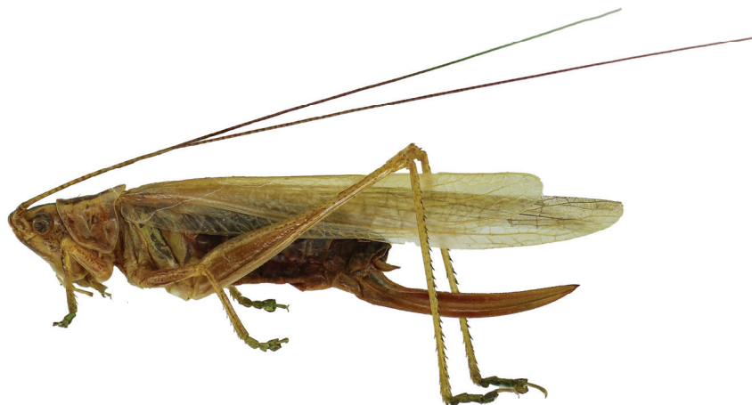
Fig. 8. Conocephalus beybienkoi , long-winged female, lateral view.

DISTRIBUTION. Mongolia (Fig. 9), Russia (south of the Chita and Amur regions, Khabarovsk and Primorsky Territory), NE China, Japan (Hokkaido).