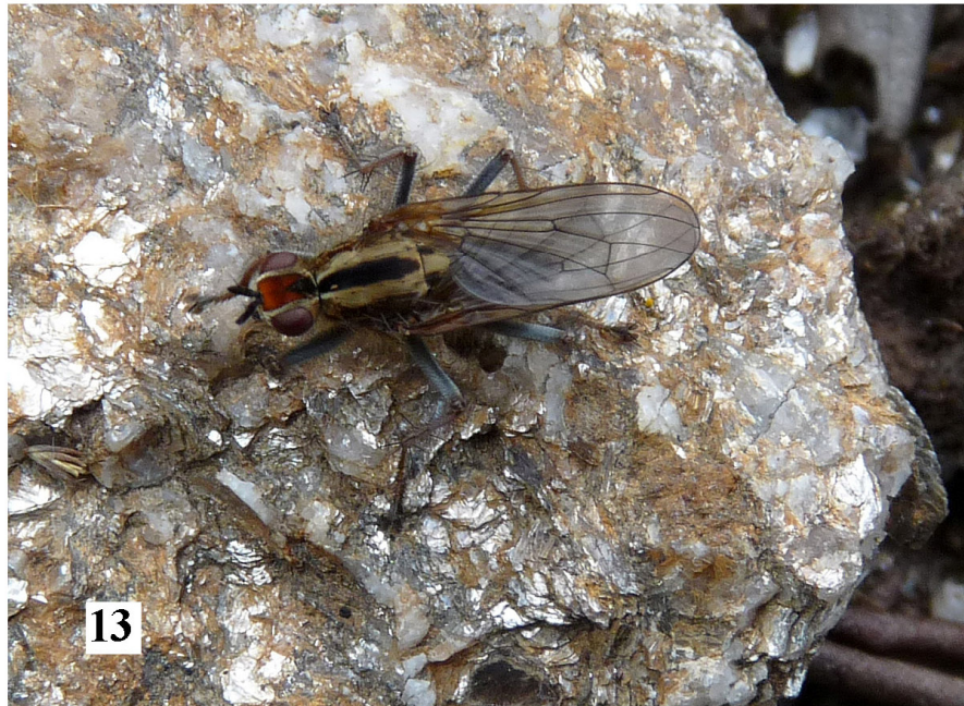
Figs 12–13. Scatomyza nigrolineata sp. n., ♂. 12 – habitus, dorsolateral view; 13 – same, dorsal view.