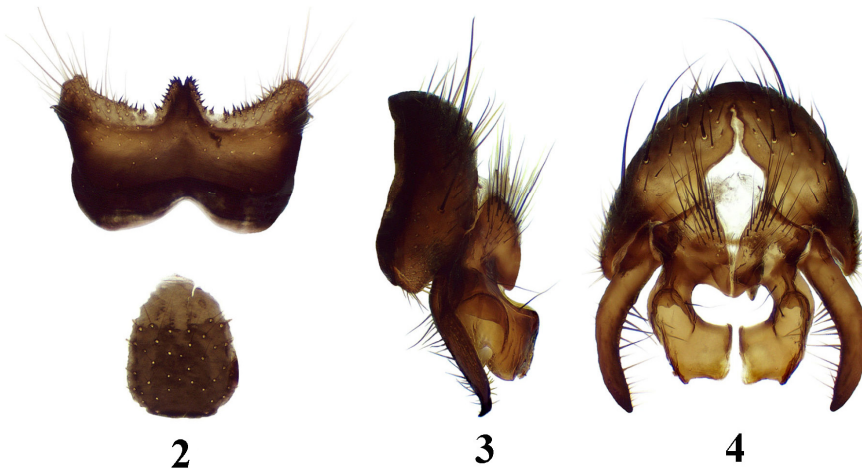
Figs 1–4. Scatomyza curtipilata (Feng, 2002), ♂. 1 – habitus, lateral view; 2 – sternites 4 (lower) and 5 (upper); 3 – epandrium, cerci and surstyli, lateral view; 4 – same, dorsal view. (Figs 2, 3, 4 – after Ozerov & Krivosheina, 2011).