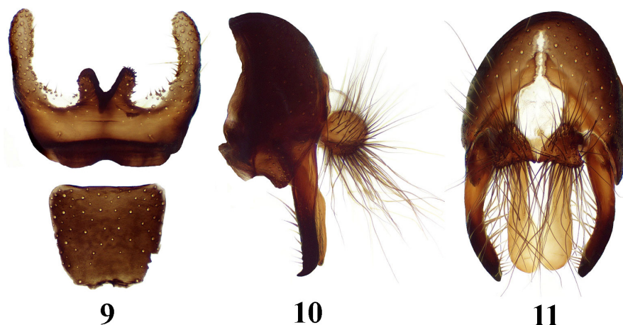
Figs. 9–11. Scatomyza mellipes (Coquillett, 1889), ♂. 9 – sternites 4 (lower) and 5 (upper); 10 – epandrium, cerci and surstyli, lateral view; 11 – same, dorsal view.

Abdomen elongate-cylindrical, black, greyish dusted, covered with yellow (male) or black (female) hairs, in female additionally tergites 2–6 with a row of marginal setae. Male sternites 4 and 5 as in Fig. 9. Cerci and surstyli as in Figs. 10, 11.