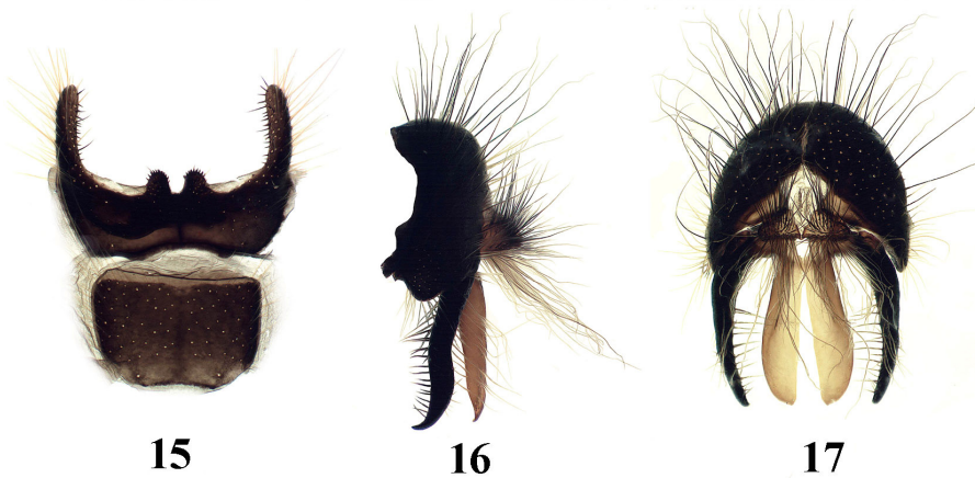
Figs 14–17. Scatomyza nigrolineata sp. n., ♂. 14 – habitat; 15 – sternites 4 (lower) and 5 (upper); 16 – epandrium, cerci and surstyli, lateral view; 17– same, dorsal view.