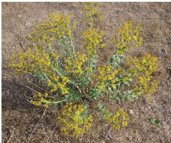
Fig. 1. Euphorbia cheiradenia Boiss. & Hohen. (Euphorbiaceae) – host plant of Aeolothrips euphorbiae sp. n.

Thrips specimens were collected on flowers of Euphorbia cheiradenia B. & H. (Fig. 1) from Ilam, Kermanshah and Lorestan provinces (west of Iran) during 2013–2015. The specimens were collected by shaking plants to white dish and were kept in 70 % alcohol ethanol and transferred to laboratory. Subsequently, thrips mounted onto slides by the protocol given in Mirabalou and Chen (2010) and some specimens were mounted on Canada Balsam. All descriptions, measurements and photos were made with a Leica DM IRB microscope, with a Leica Image 1000 system. Type specimens are deposited in the Collection of Department of Plant Protection, College of Agriculture, Ilam University, Iran ( ILAMU ), and five paratypes in Agricultural & Natural Resource Research Centre of Khorasan-e Shomali.