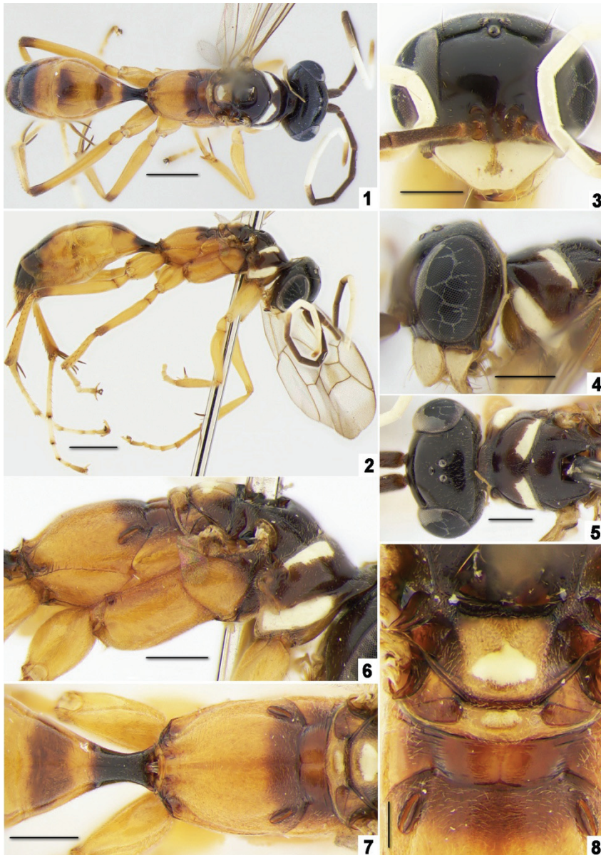
Figs 1–8. Eopriocnemis albiflagellata Loktionov et Lelej, sp. n. , holotype, ♀. 1 – habitus, dorsal view; 2 – habitus, lateral view; 3 – head, frontal view; 4 – head and pronotum, lateral view; 5 – head, pronotum and mesoscutum, dorsal view; 6 – mesosoma, lateral view; 7 – mesoscutellum, metanotum, metapostnotum, propodeum and T1, dorsal view; 8 – axilla, mesoscutellum, metanotum, metapostnotum and propodeum anteriorly, dorsal view. Scale bar: 1, 2 = 1.0 mm; 3–7 = 0.5 mm; 8 = 0.2 mm.