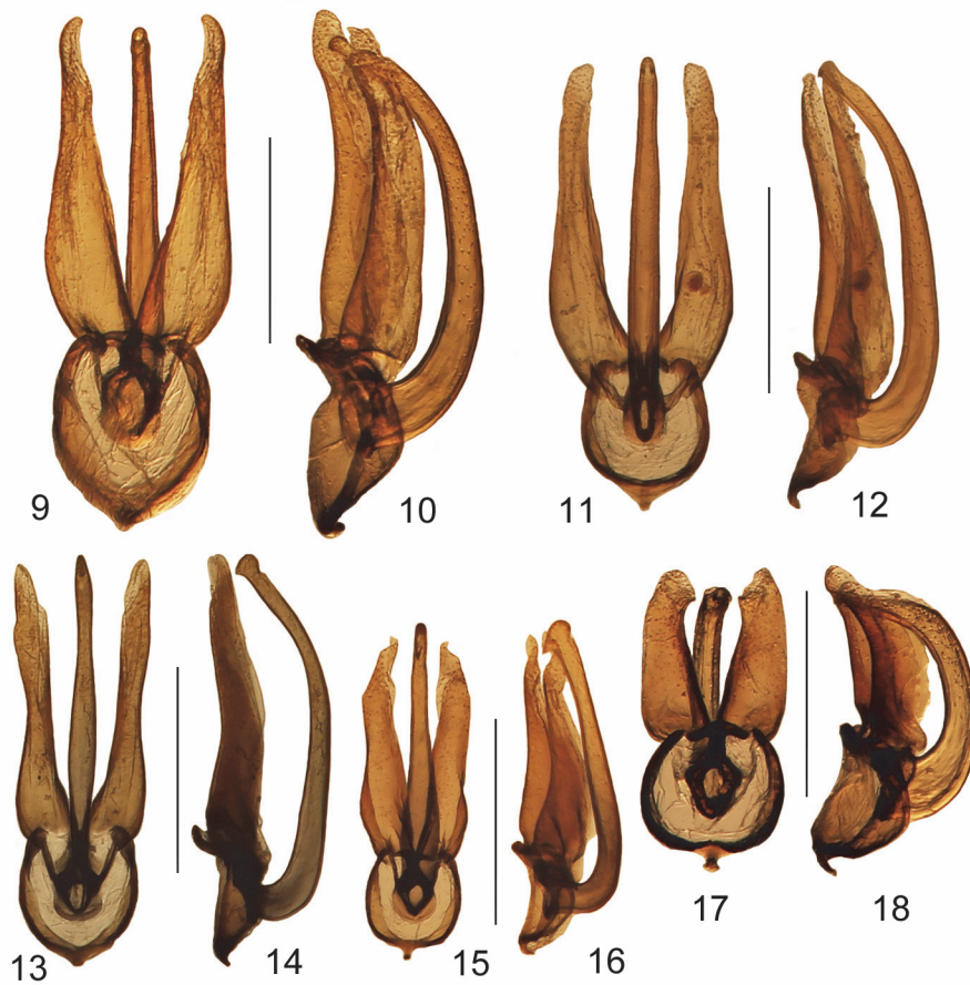
Figs 9–18. Aedeagi of Xylobanellus species: 9, 10 – X. erythropterus ; 11, 12 – X. gansuensis ; 13, 14 – X. cerasinus ; 15, 16 – X. honghensis sp. n.; 17, 18 – X. tenuis ; 9, 11, 13, 15, 17 – dorsally; 10, 12, 14, 16, 18 – laterally. Scale bars: 0.5 mm.

Elytra long, ca. 4 times longer than wide at humeri, parallel-sided, slightly dehiscent from scutellar area to apices; pubescence uniform, short and semi-erect (Fig. 7).