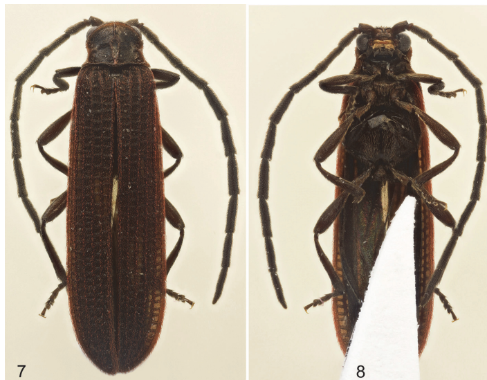
Figs 7, 8. General view of Xylobanellus honghensis sp. n., holotype male: 7 – dorsally; 8 – ventrally.

REMARK. The species was described after a female (Kazantsev, 2000). When a male was collected shortly afterwards, the description was complemented with male characters (Kazantsev, 2002).