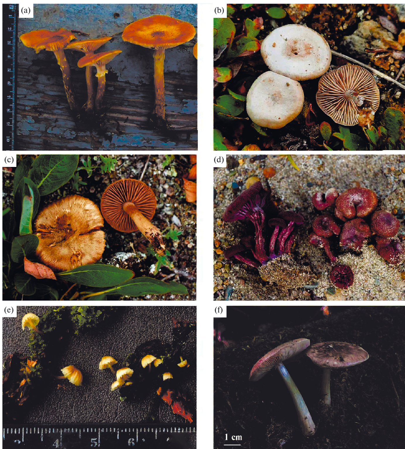
Fig. 1. Fruiting bodies of some rare species of macromycetes: a – Armillaria cepistipes VLA M-23376 (photo by E. Erofeeva); b – Clitopilopsis hirneola MAG 6049 (photo by N. Sazanova); c – Inocybe alpigenes MAG 5952 (photo by N. Sazanova); d – Laccaria amethysteo-occidentalis MAG 5764 (photo by N. Sazanova); e – Mycena meliigena VLA M-28063 (photo by E. Erofeeva); f – Pluteus hibbettii LE F-347543 (photo by O. Morozova).