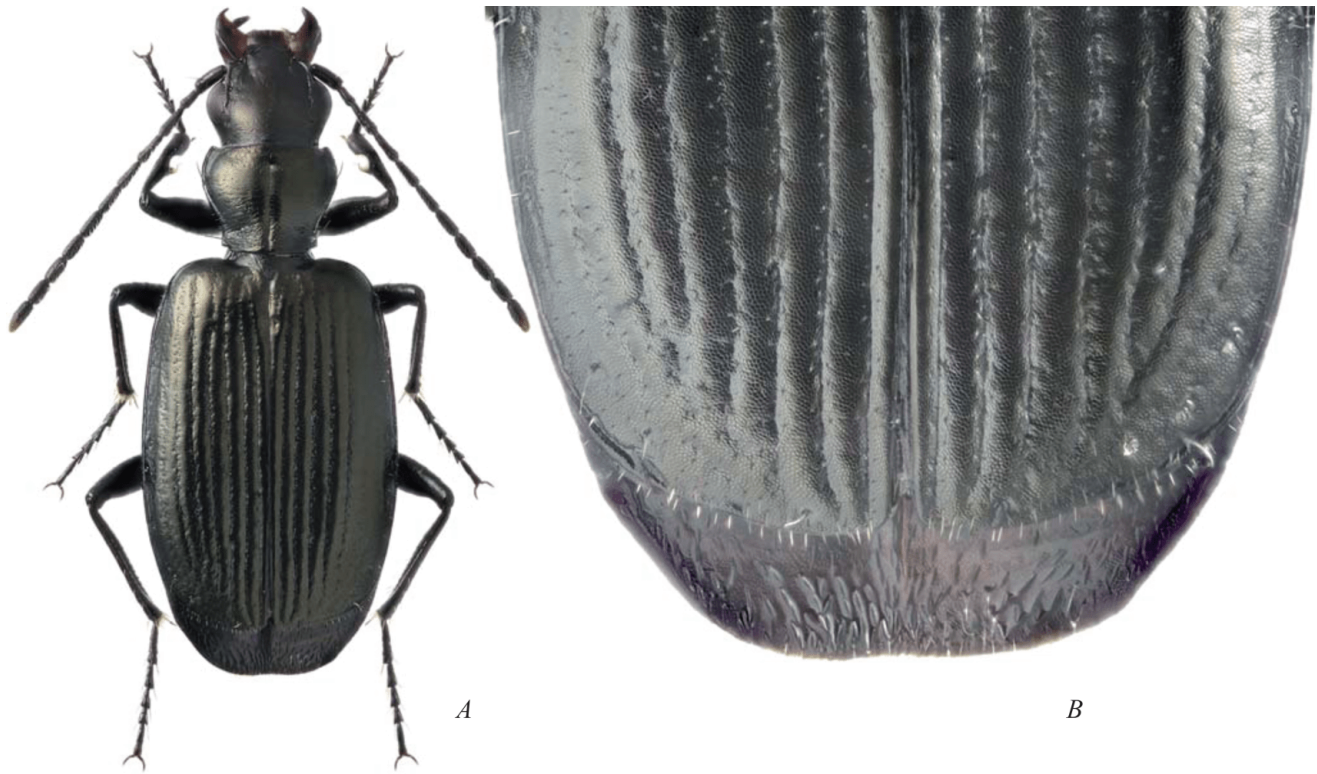
Fig. 2. Apristus grandis Andrewes, 1937, female, Susuya River, Southern Sakhalin: (A) habitus; (B) apical part of elytra.

Kryzhanovskij and Molodova (1973), Molodova (1973), and Pavlova (1979) as Bembidion sp. pr. captivorum , as well as by Kryzhanovskij and co-authors (Kryzhanovskij et al., 1995) (in Sakhalin, the species is replaced by the closely related B. poppii pohlai Kirschenhofer, 1984, and remains to be confirmed); B. difficile (Motschulsky, 1844), recorded by Lafer and Kuznetsov (1996) as B. ?difficile ; B. oxyglymma Bates, 1883, recorded by Yokoyama and Kano (1927) but not found subsequently; B. quadrimaculatum (Linnaeus, 1760), recorded by Berlov and Berlov (1997) as B. mandli Netolitzky, 1932 (on Sakhalin, the species is replaced by the closely related B. paediscum Bates, 1883 and remains to be confirmed); Carabus latreillei Fischer von Waldheim, 1820, recorded by Berlov and Berlov (1997) as “1 spm. from Sakhalin, obtained from Pervukhin, remains to be confirmed”; Chlaenius insularis (Uéno, 1964), recorded by Vertyankin and Shabalin (2013) (the erroneous name Ch. insularis Kryzhanovskij, 1973 = Ch. circumductus A. Morawitz, 1862); Elaphrus comatus Goulet, 1983, recorded by the Japanese authors (Yoshimatsu et al., 2018) based on the material “S. Saghaliën: Saghaliën